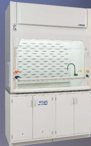
UniFlow SE AirStream High Performance Energy Efficient Laboratory Fume Hoods