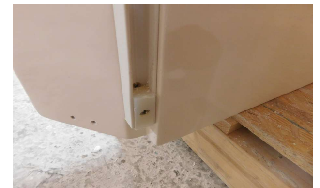
Detail: 2 Sash bottom stop located in track just above airfoil.