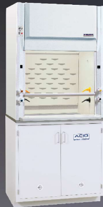
UniFlow CE AirStream