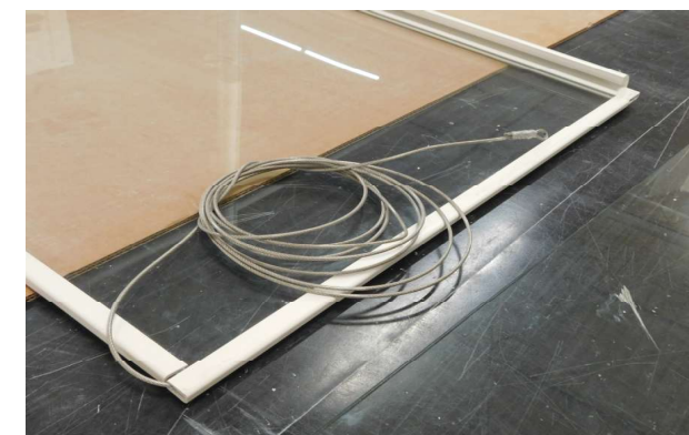
Detail: 1 Cable connecting to sash.