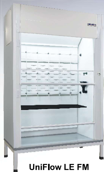
UniFlow LE FM