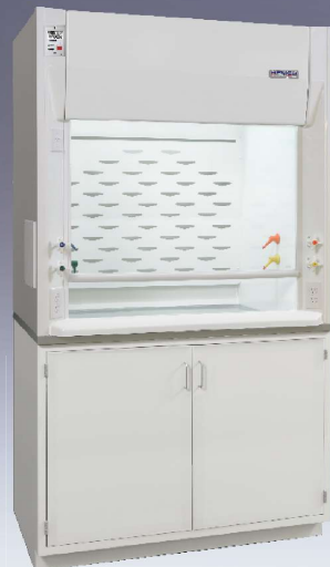
UniFlow LE AirStream